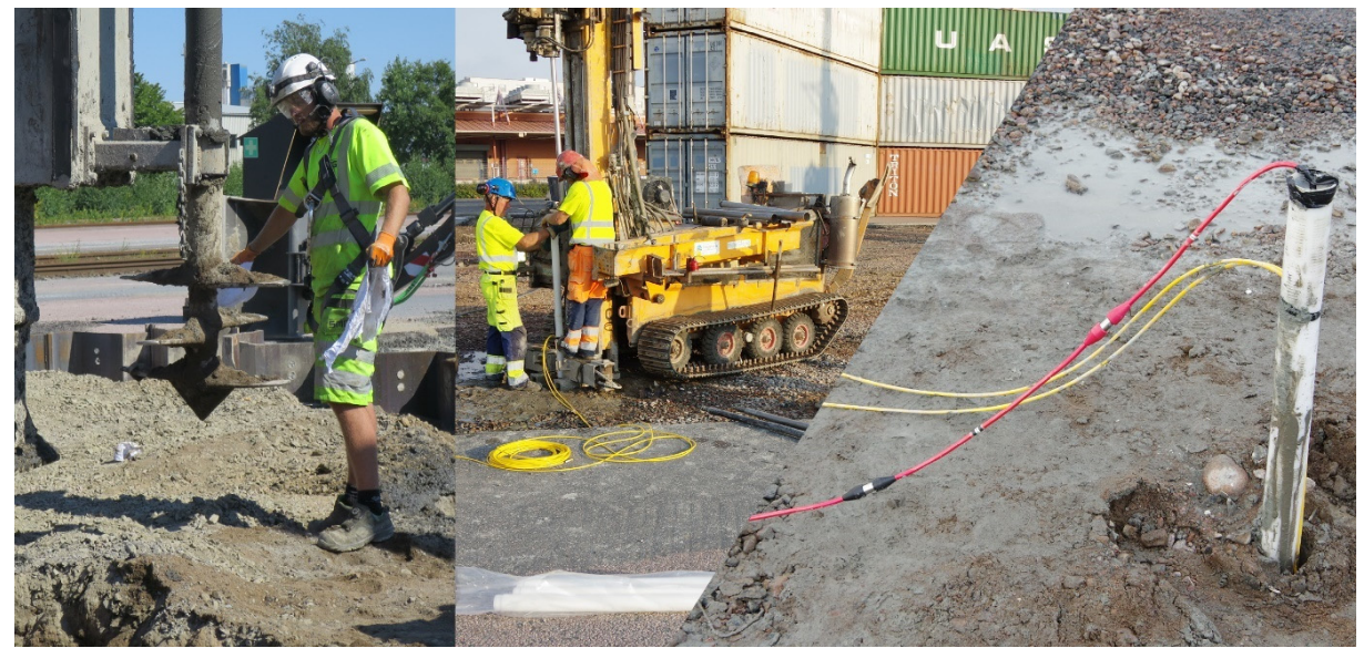
Figure 1 Documentation of the field installations and measurements: mixing tool with 80 cm diameter (left), installation of slotted PVC-pipe (middle) and installed ERT-cable (right).